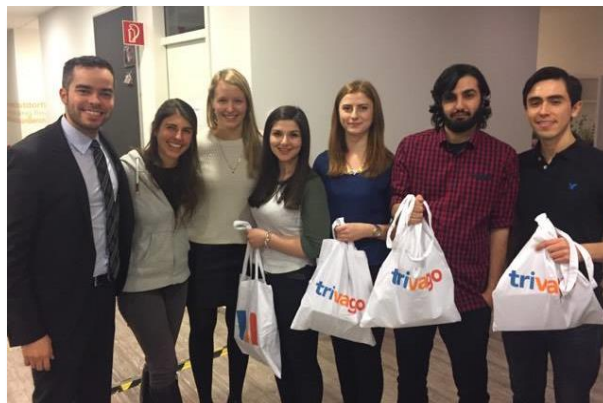
Class visit to Trivago in Düsseldorf

"As an international student pursuing a double degree at iubh, I had an amazing experience immersing into the international setting that this university offers. Being able to study abroad has been a dream I've always wanted to pursue and this was a great opportunity as Germany is a great country to study in since the education system is very different from the one of the U.S; however, I received continuous support from the staff and my professors which enabled me to accomplish my double degree after successfully completing a year here. Germany is a country rich in culture and the people are friendly which makes the transition easier. I had the opportunity to travel a lot and meet wonderful people who I know will remain long-term friendships and industry contacts." (A student from Niagara University, USA)