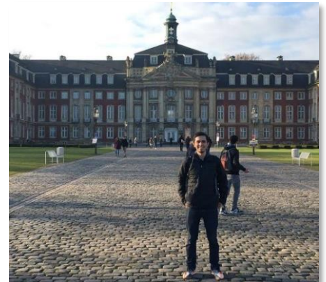
Visit to Münster Fürstbischöfliches Schloss

"iubh is a great school with many wonderful opportunities for students. I was first greeted upon arrival here in September 2011 by my "GReeTER" at the airport, which was organized by the International Office. They helped us all ease into the quick and easy transition to living in a foreign country. The International Office has been there whenever I had questions and was beyond helpful. Also teachers were easy to approach and talk to when I had questions about class and such. After this year at iubh, I'm ready to explore and see what else the world has to offer me!"