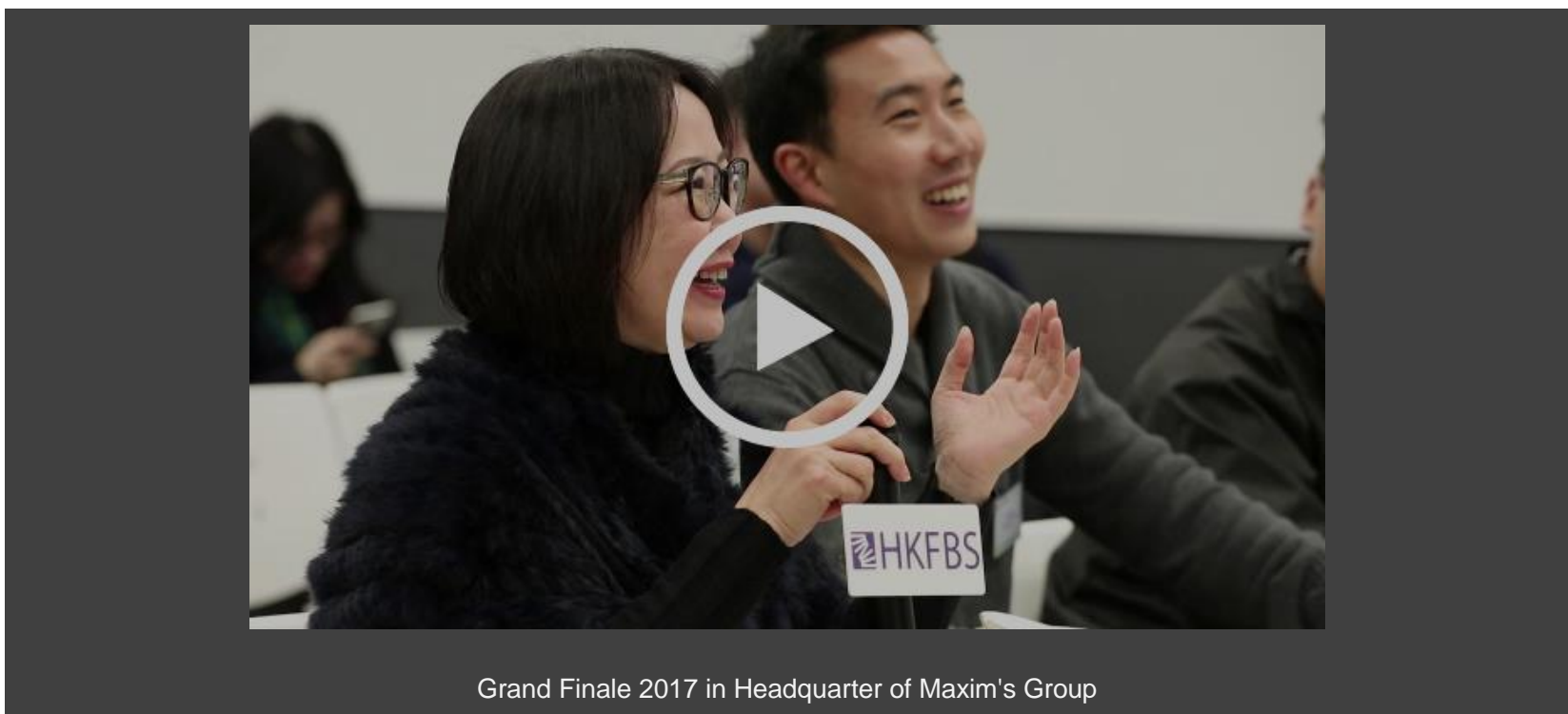
Grand Finale 2017 in Headquarter of Maxim's Group

CSR CHALLENGE 2017 - Responsible Eating Sustainable Living Grand Final We are honored to have Maxim's Group as our Title Sponsor for the third year.